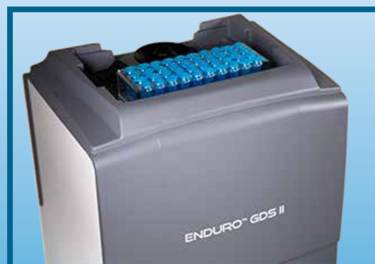
Maximize Valuable Lab Space with Small Footprint and Storage on Top